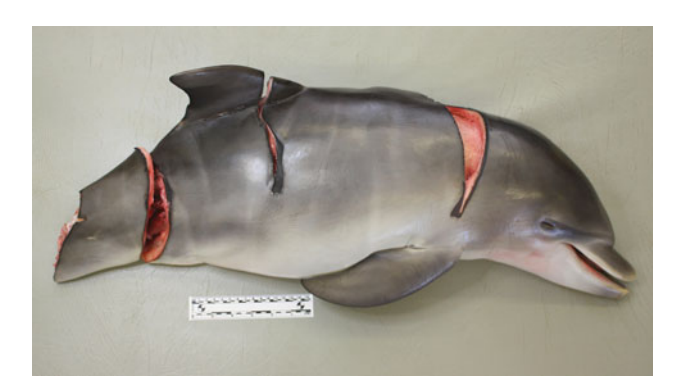
Fig. 1 The carcass of a neonatal Indo-Pacific bottlenose dolphin ( Tursiops aduncus ) showing four incised/chop wounds along the right side , with amputation of the tail. These parallel deep injuries are typical of those sustained from contact with rapidly rotating blades of propellers

AMWRRO [3] and The University of Adelaide, South Australia, have been monitoring cases of marine mammal deaths due to propeller strike injuries and in a recent report noted that distinguishing features are the symmetrical and parallel nature of the incised/chop wounds [4, 5]. These characteristic findings occur as propellers that strike sea mammals are usually attached to fast moving boats and have rapidly rotating blades that are able to deliver a rapid series of wounds in quick succession, before the injured animal is able to take evasive action [6]. Thus, multiple closely spaced injuries may occur with only one impact. Certainly in the reported case both the thoracic and tail wounds would have almost instantly incapacitated the animal. Amputations and injuries to major blood vessels with resultant hemorrhage are a frequent occurrence in these types of injuries [7]. The deep vertebral column injuries in the reported animal indicate the significant impact force that may be sustained in propeller injuries.