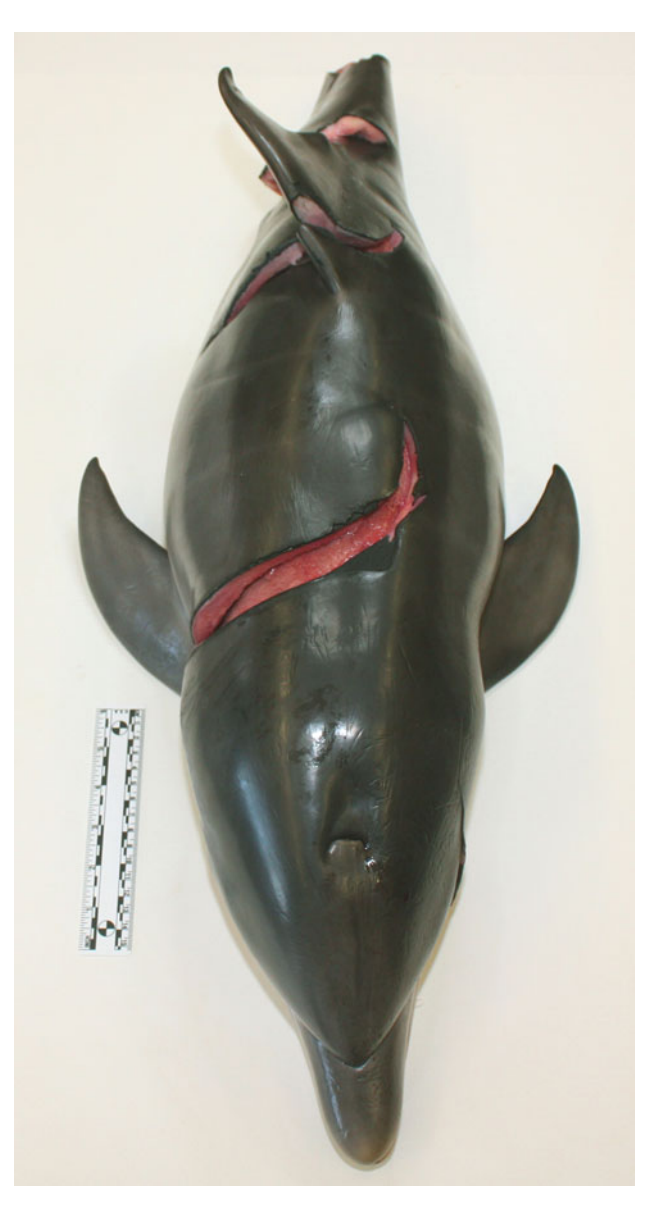
Fig. 2 The dorsal aspect of the dolphin demonstrating more clearly the parallel nature of the curvilinear incised wounds

An important role in the forensic assessment of sea mammal injuries is to determine whether human or animal intervention was likely, whether these occurred ante- or post-mortem, and whether these had been intentional or not. The injuries in the reported animal were clearly antemortem given the degree of paraspinal hemorrhage around the vertebral and rib fracture sites. They were also quite distinct from those that may have been sustained during a shark attack [8] given the repetitive pattern, with shelving, and deep chop wounds through vertebral bodies. Determining whether the injuries were deliberately inflicted or not is a more difficult exercise. Anecdotally, reports occur of boats and surf skis being deliberately driven towards dolphins, and a local newspaper in Tasmania recently reported that "jet skiers have ploughed through a dolphin pod that included baby dolphins". Video footage with the story on the internet provided verification [9]. Deliberate killing of marine mammals is also well reported