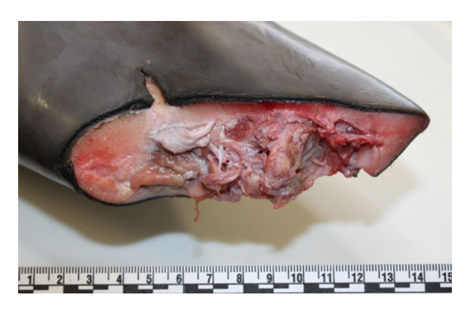
Fig. 5 Amputation of the tail with severing of major vessels